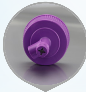
danumed® Universal Adapter